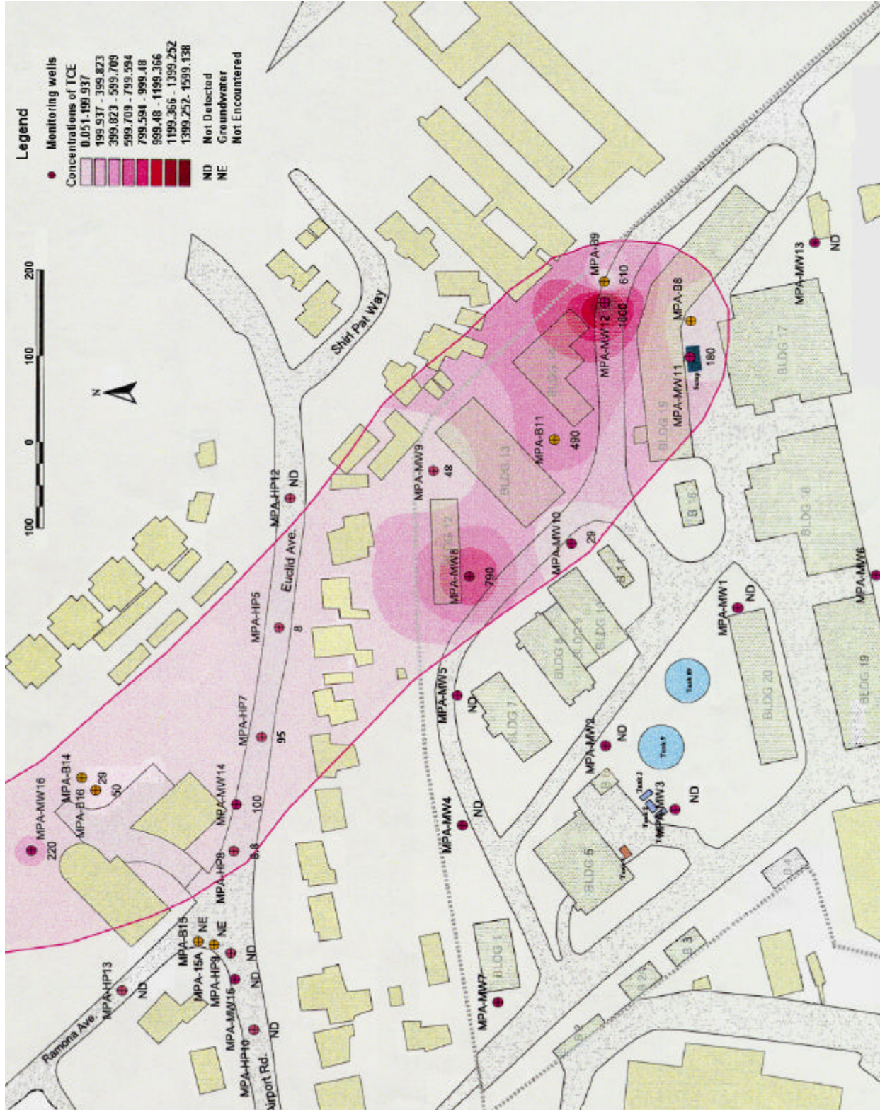
FIGURE 2: EXTENT OF TCE PLUME

Figure 2 provides a graphic representation of the TCE plume, showing placement of the soil borings, monitoring wells, and temporary wells.