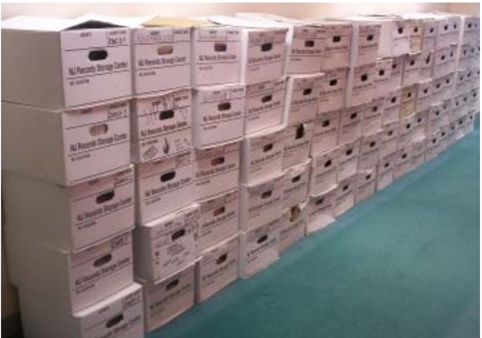
Figure 1. A common means of data storage even in 2005 in many agencies.

This overview introduces the reader to the basic concepts of Data Management, Analysis and Visualization Techniques (DMAVT). In 2004, the Interstate Technology and Regulatory Council (ITRC) Remediation Process Optimization (RPO) Team developed a technical regulatory guidance document titled, Remediation Process Optimization: Identifying Opportunities for Enhanced and More Efficient Site Remediation . Based on feedback to the RPO training and continued research into the topic, the RPO team identified the need for detailed information on DMAVT. Data Management, Analysis, and Visualization Techniques in some ways are important tools in successfully measuring the progress of a remediation or a monitoring program. This overview will further develop the basic concepts of DMAVT and their potential application to site rehabilitation projects.