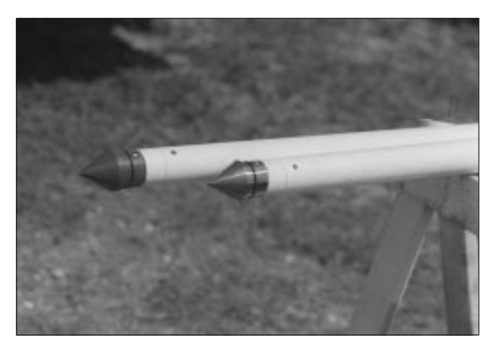
Figure 2. 1.25-Inch outer screen.

Field Demonstration. Specific tasks accomplished in the field: