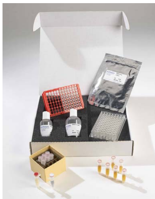
Figure 3. Procept® Rapid Dioxin Assay Kit